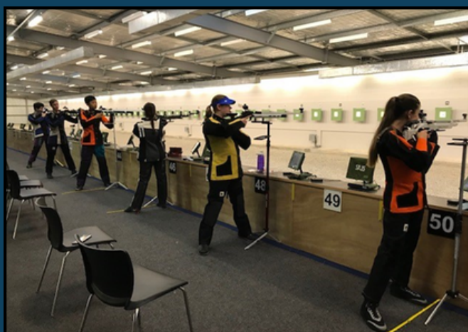
Covid times – every second bay