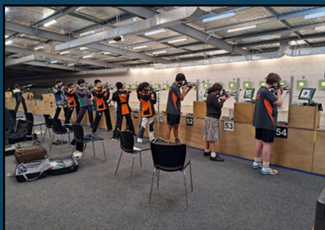
An intense game of Snakes and Portals taking place. This game was taught to at the Adelaide camp and the kids love it! Teaches focus in times of distractions.