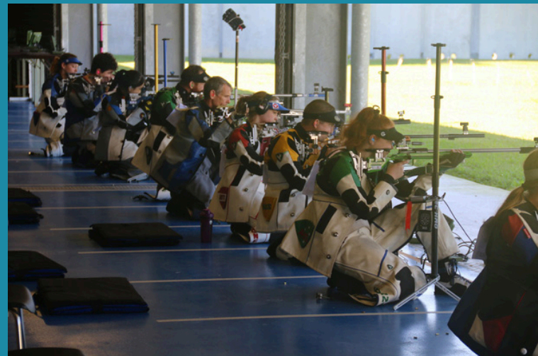
50m 3P qualification shooters beginning in the kneeling position