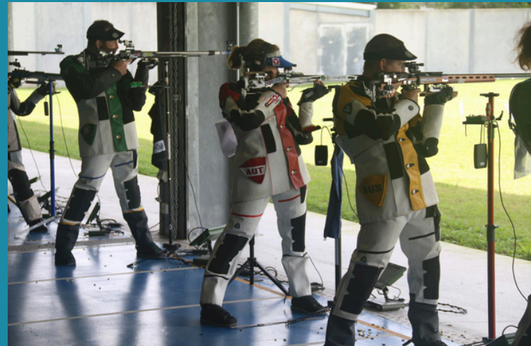
Shooters finishing the qualification with the final position, standing.